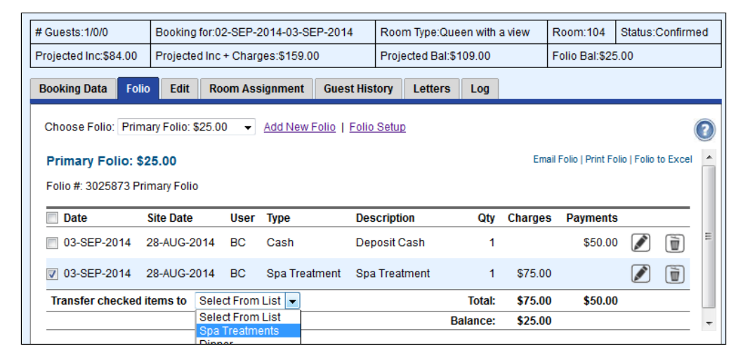
Click to enlarge image