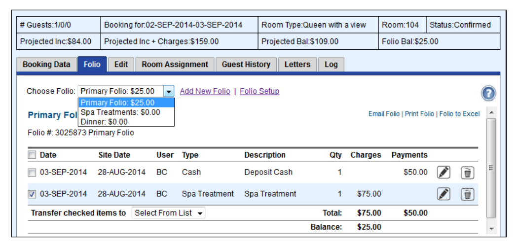
Click to enlarge image